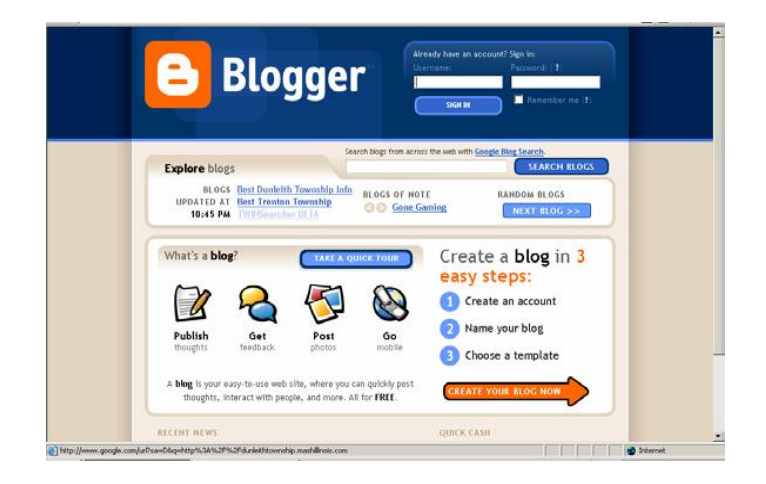
Figure 1: Blogging in the ESL/EFL classroom

increase students' reflective learning process (Xie et al, 2008), and to develop a L2 community of writers (Sollars, 2007). Best of all, blogs are a type of user-friendly technology. Students will find them convenient and accessible to do blogging anywhere and anytime via a smart phone, tablet or desktop computer which has access to the Internet.